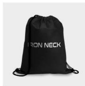
Drawstring Bag SKU: BAG