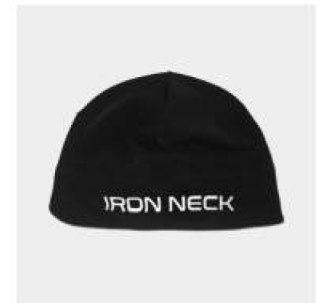
Skull Cap SKU: SKCAP