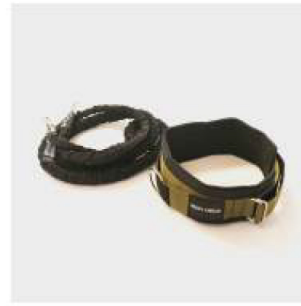
Speed Trainer Bundle SKU: SPD-BDL