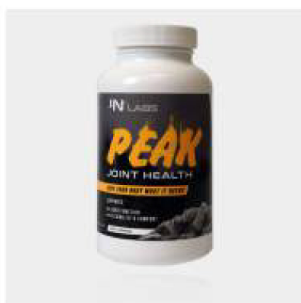
Peak Joint Health SKU: SUPP-PJH