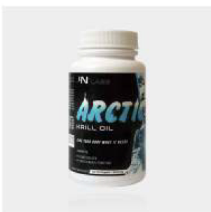
Arctic Krill Oil SKU: SUPP-AKO