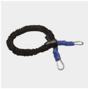
RX Resistance Bands SKU: RB05 SKU: RB10 SKU: RB25 SKU: RB35 SKU: RB50