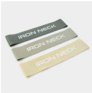
Hip & Glute Loops SKU: GLUTE-LPS