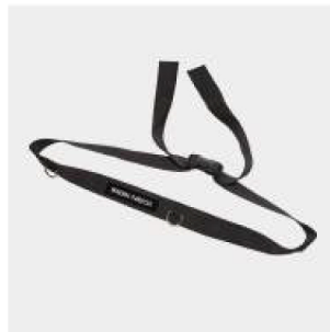
Tri Clip Door Belt SKU: DBELT