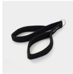
RX Tricep Handle SKU: TRI