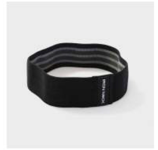
Hip & Glute Bands SKU: GLUTE-TBD