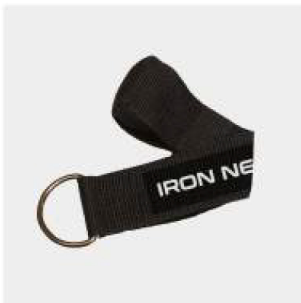
Safe Lock Door Anchor SKU: DANCHOR