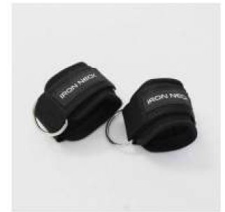
RX Ankle & Wrist Straps SKU: STRAPS