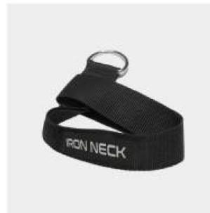
EZ Cinch Anchor SKU: ANCHOR