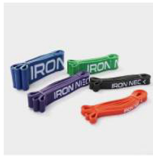
Power Bands SKU: POWB-XH SKU: POWB-H SKU: POWB-M SKU: POWB-L SKU: POWB-XL