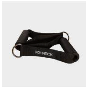
RX Handles SKU: HANDLES